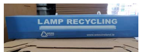
Tubes and bulbs contained in WEEE Ireland lighting boxes