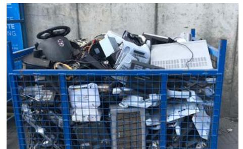
Small appliances in WEEE cages

Please do not overfill the WEEE cages or trolleys.