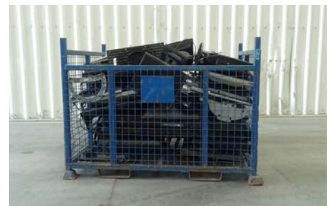
Televisions and monitors in WEEE cages