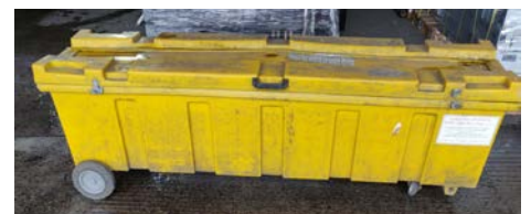
Tubes and bulbs contained in lighting coffins