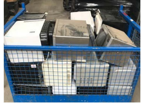
Large equipment shrink-wrapped to wooden pallets