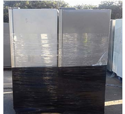
Fridge Freezers shrink-wrapped to wooden pallet

Refrigerant media typically found in fridges, freezers, air conditioners, dehumidifiers, etc. can leak from appliances if damaged, harming the environment and causing skin or eye irritation as a result of direct contact with the rapidly evaporating refrigerant. When being presented for collection, appliances must be free of any contamination e.g. foodstuff and packaging. Take care to protect the exposed rear wire condenser on the back of fridges and freezers stack these appliances facing frontwards so that it is not possible to grip the appliance by the condenser on either side. Appliances should be shrink-wrapped securely to a wooden pallet as pictured. If stacking is required, ensure it is done so heaviest at the bottom, lightest at the top to prevent damage.